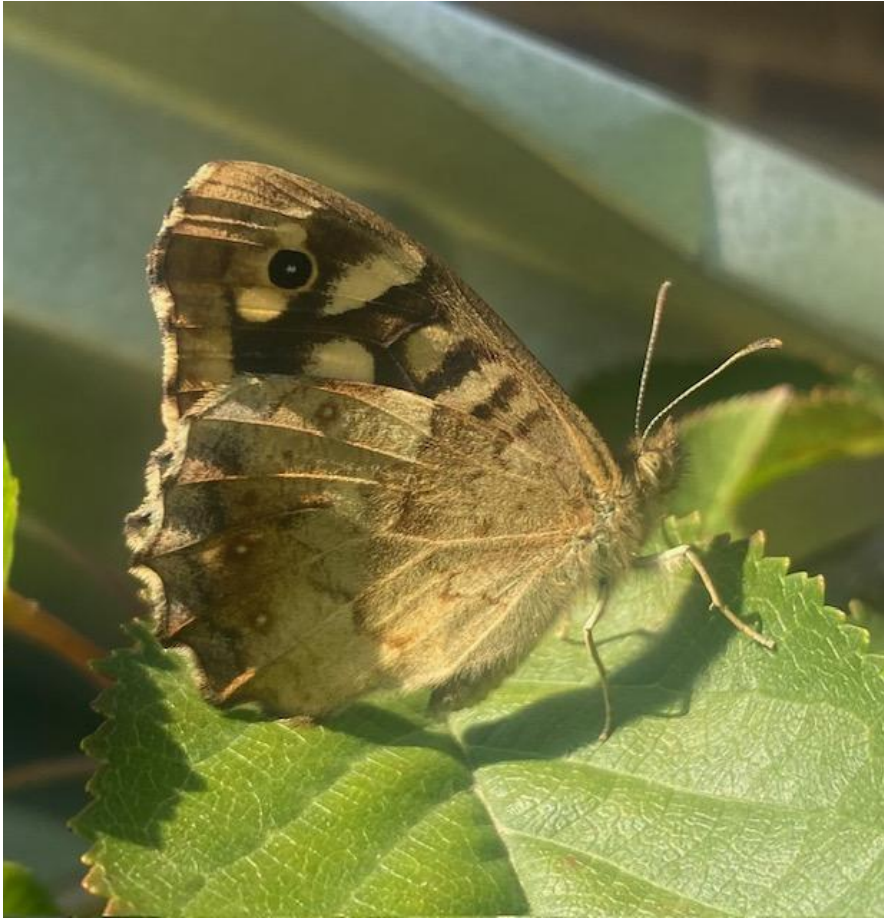
Speckled Wood butterfly feeding on the blackberry bushes surrounding the school grounds.