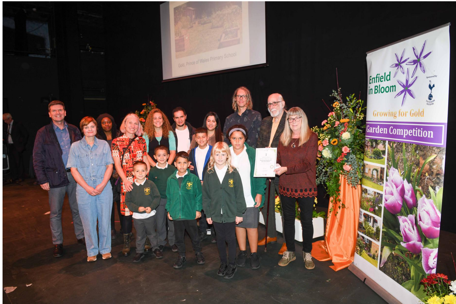
Receiving our GOLD award at Enfield in Bloom with the parents and children from PoW Community Gardening Club