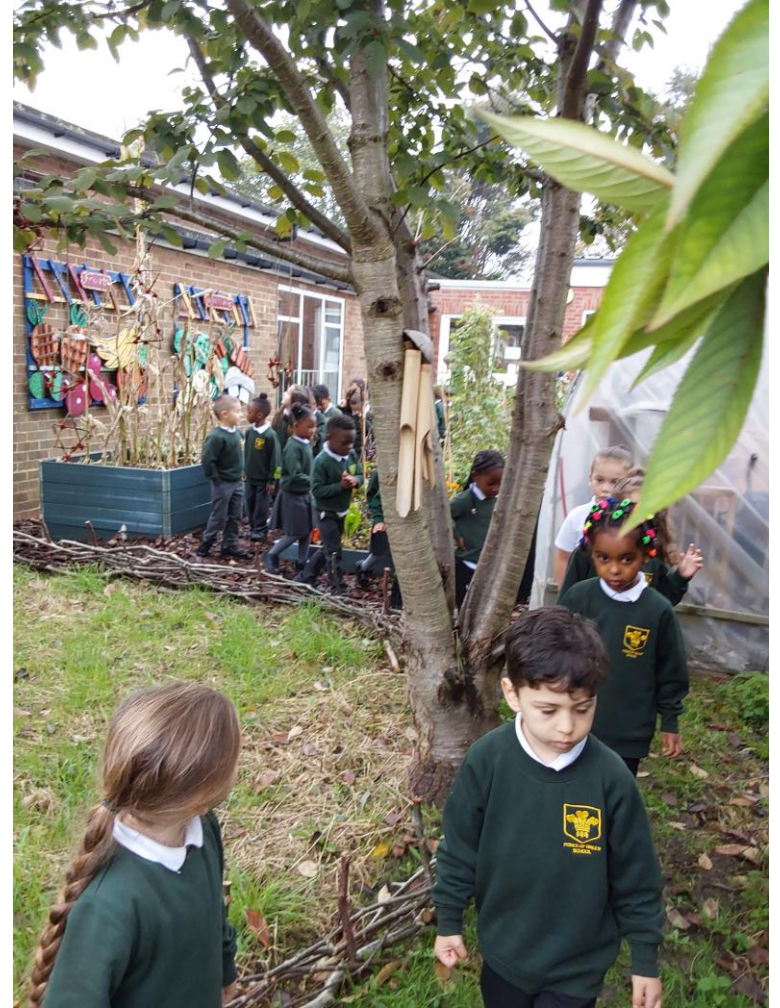
The children enjoyed the wildlife trail we have made by creating a natural grass path and recycled wood fence.