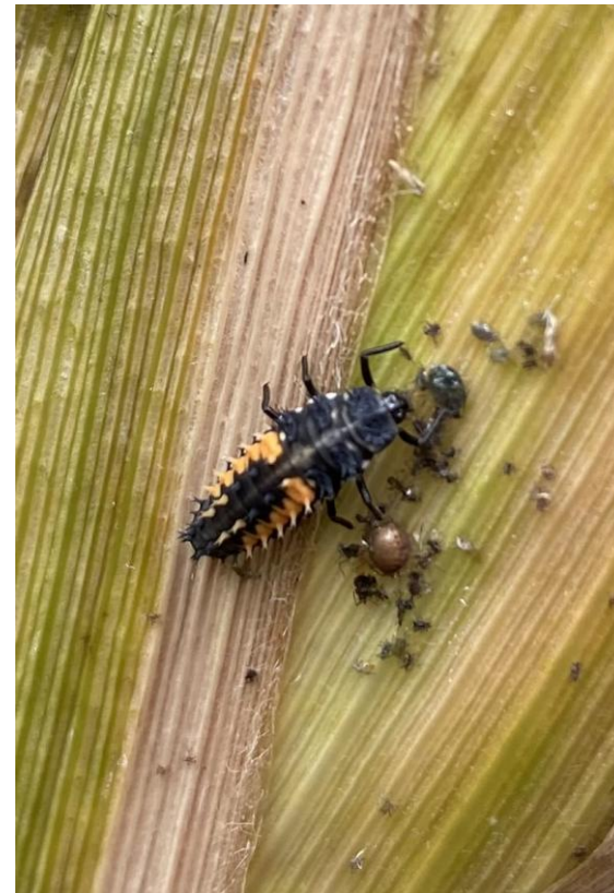
These are Ladybird larvae, which were found feeding on the blackfly covering some of our sweetcorn crop.