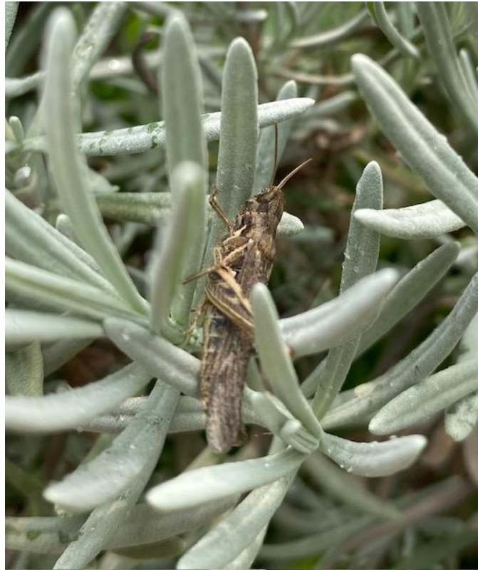
Grasshopper on the Lavender in the allotment garden. The grasshoppers have really been enjoying the long grass in this garden.