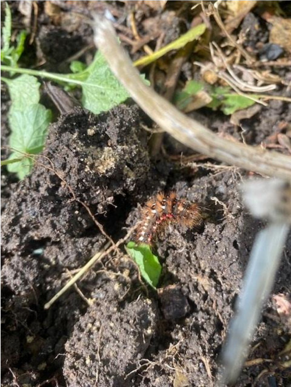
This is a Knot Grass moth caterpillar found while we were digging over a flowerbed in the year 4 garden.