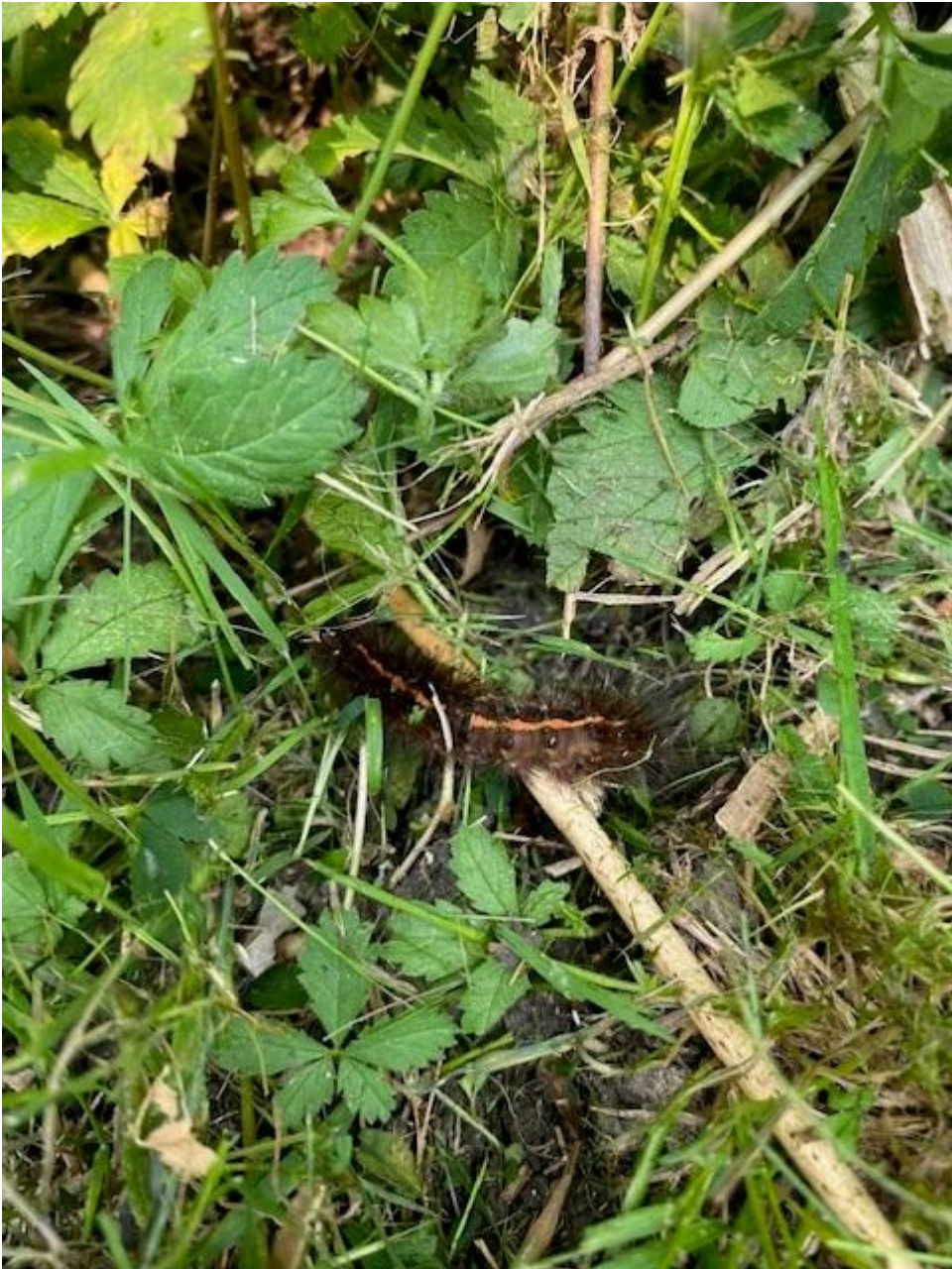
White Ermine Moth Caterpillar- these were abundant in the dead hedge of the allotment garden.