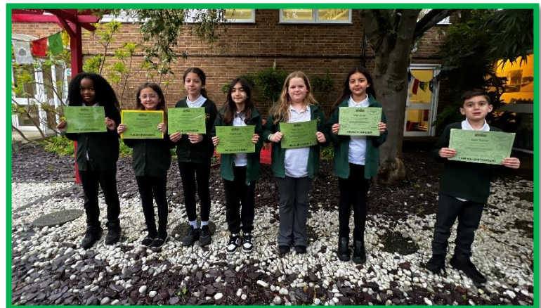
Outstanding UPSTANDER behaviour